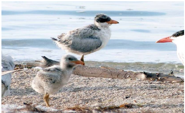
4-week old chick (in background):