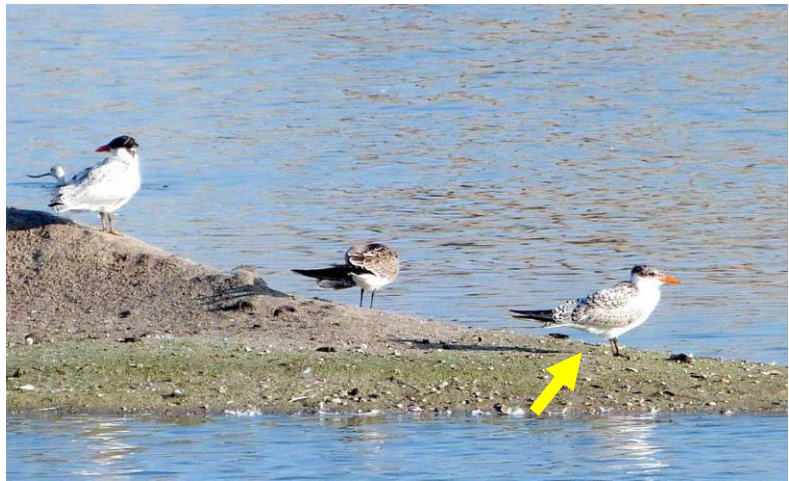
One-year old (a.k.a., second-year or SY) Caspian Tern ( note brown-tipped beak ):